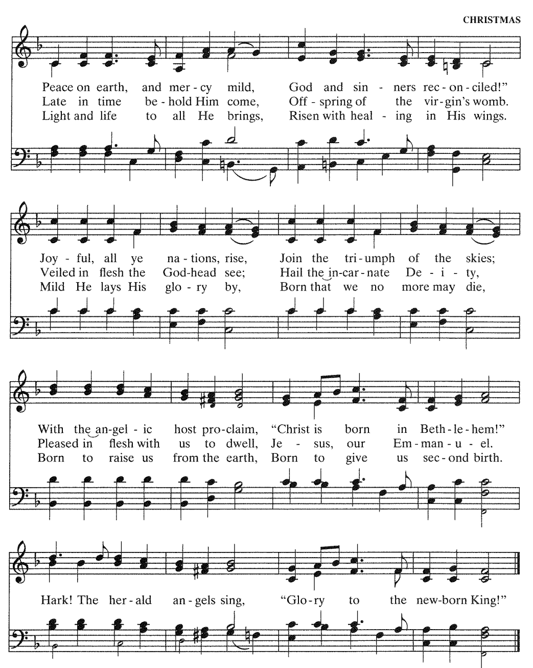
*Descant and alternate harmonization for stanza 3, 32