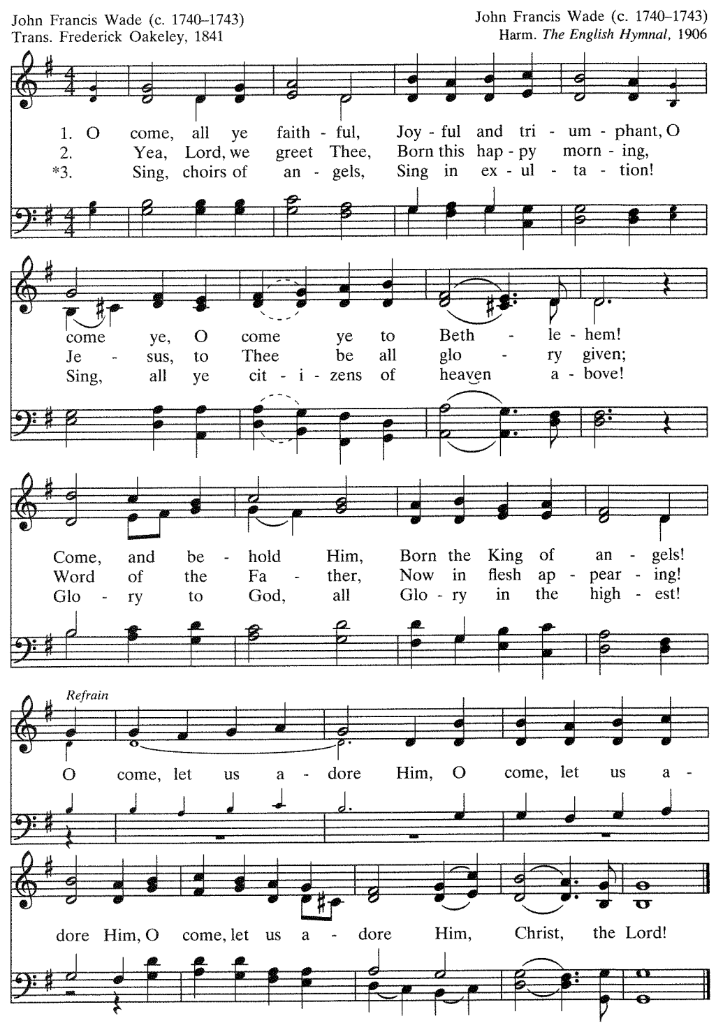
*Alternate harmonization and descant for stanza 3, 42